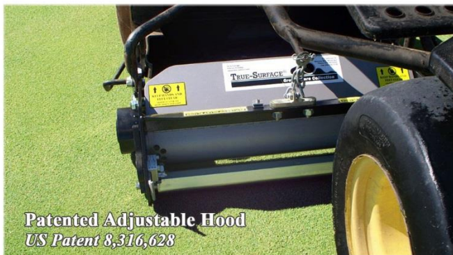
Patented Adjustable Hood US Patent 8,316,628