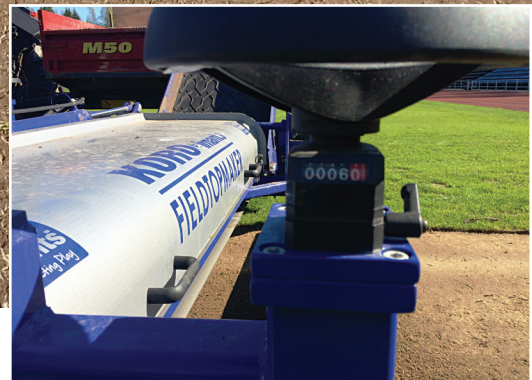
Depth setting is accurate to 0.5mm, via a digital display read out