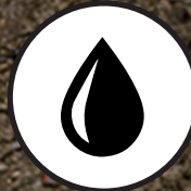
IMPROVE WATER ABSORPTION