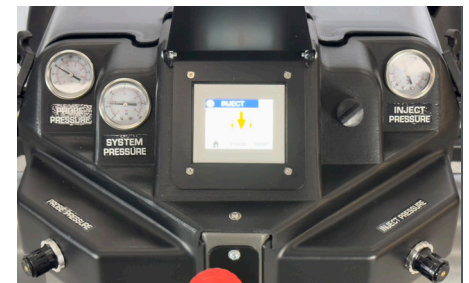
REDESIGNED USER CONTROL DASHBOARD