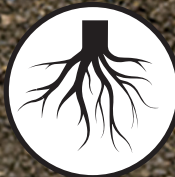
PROMOTE DEEPER ROOT GROWTH