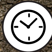
NO DOWNTIME OR CLEAN UP