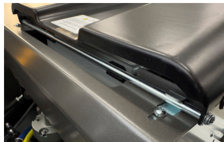
ROBUST EASY TO REMOVE HOOD