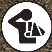
REDUCE PLAYER INJURIES