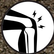
REDUCE JOINT STRESS