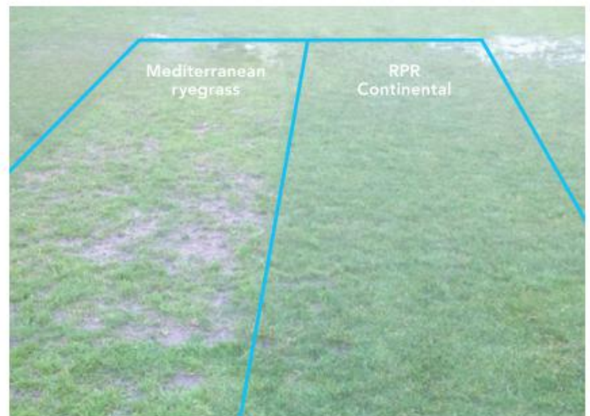
Natural wear trial from Tasmania against a Mediterranean ryegrass