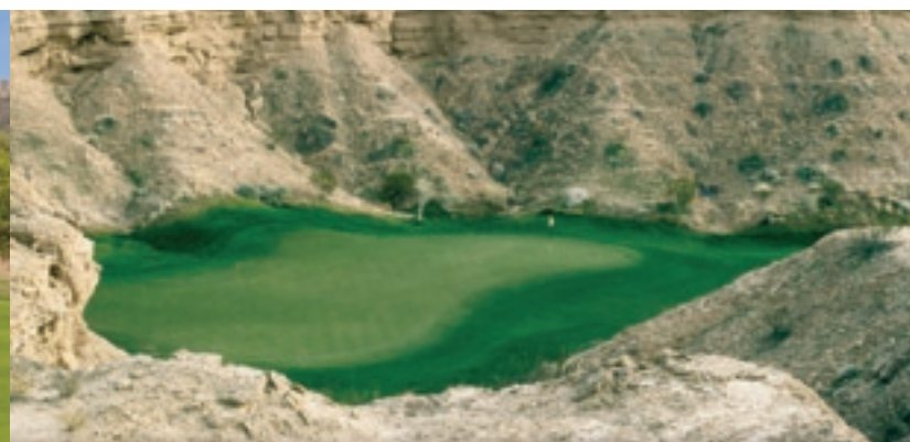
The greens at the Oasis Golf Course in Mesquite, Nevada, constructed with a sand/Profile mix in 1992, continue to thrive.