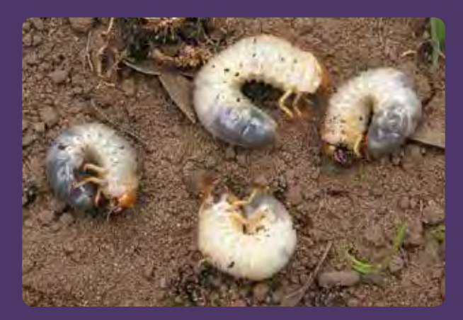
High density scarab larvae populations found beneath damaged turf.

Turf including golf courses, bowling greens, sports fields, race tracks, recreational lawns and turf farms.