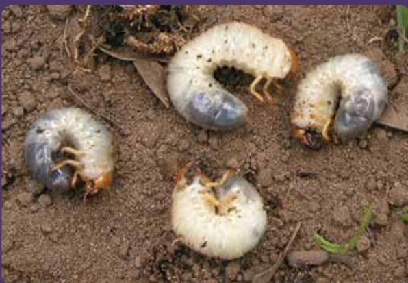
High density scarab larvae populations found beneath damaged turf.

Turf including golf courses, bowling greens, sports fields, race tracks, recreational lawns and turf farms.