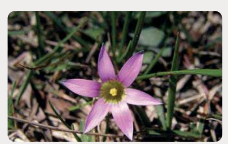
Guildford grass (Romulea rosea)