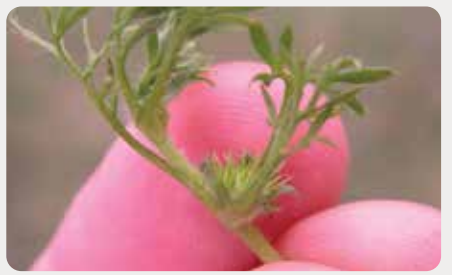
Bindii (Soliva sessilis)