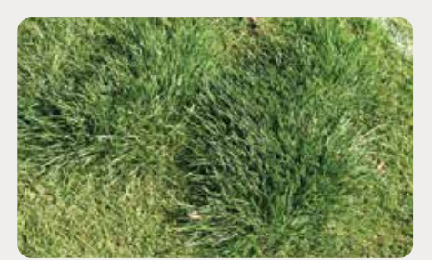
Ryegrass (Lolium perenne)

Regulatory information: All pesticides are regulated under the Agricultural and Veterinary Chemicals Act to ensure that they do not pose an unacceptable risk to human health and the environment. For information regarding pesticide regulatory process please visit the Australian Pesticides and Veterinary Medicines Authority website at www.apvma.gov.au