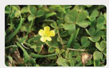
Oxalis (Oxalis corniculata)