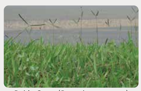
Bahia Grass (Paspalum notatum)